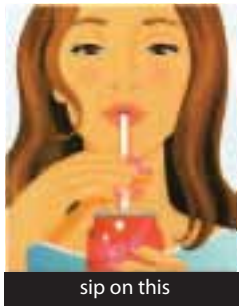
sip on this

of toothpaste in a small bowl with a teaspoon of baking soda and a drop of lemon juice, says NYC cosmetic dentist Lana Rozenberg. (The baking soda removes surface stains, and the acid in the juice is a natural brightener.) Brush as usual for two minutes. Your teeth will be whiter after a few applications.